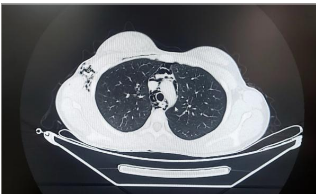
Figure 2: Thoracic computed tomography demonstrated extensive subcutaneous emphysema and pneumomediastinum, predominantly localized within the anterior mediastinum.