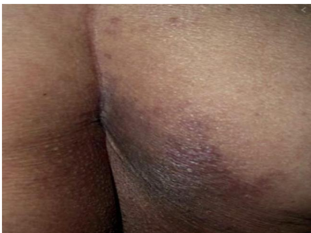
Figure 1: Varicella Zoster Virus-induced rash in the S2-S4 dermatomal distribution.

A 42-year-old female presented to the emergency department (ED) with a painful rash on her left buttock and urinary retention for the past two days. She was previously diagnosed with shingles four days before appearing in the ED and was started on a ten-day course of valacyclovir. She had no past medical conditions and was afebrile on the day she was seen. The physical exam was remarkable only for a distended bladder on palpation and an S2-S4 dermatomal vesicular rash (Figure 1) extending onto the vulva and introitus. Tramadol was administered in the ED to relieve the pain. A post void bladder scan revealed a residual volume of 824 ml (Figure 2). A neurology consult was obtained, which recommended MRI of the cervical, thoracic and lumbar spine. These scans were unremarkable as were urinalysis and routine blood tests. A urology consult suggested the likely etiology was bladder areflexia due to shingles. The urologist recommended that the patient be discharged with a Foley catheter and leg bag. The patient refused and requested the removal of the Foley catheter. The patient was able to void successfully as measured by follow up bladder scan indicating 0mL residual volume. The patient was discharged with instructions to return for urinary retention and urologic