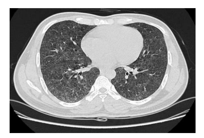
Figure 2: Diffuse ground-glass opacities (GGO) with superimposed intra and interlobular regular nodular septal thickening and a few small areas of air trapping.

Examination revealed an averagely built and nourished patient. His body mass index (BMI) was 21.3 \text{ kg/m}^2 . He was febrile; other vitals parameters were normal. Oxygen saturation was 97% on room air. General examination and examination of upper respiratory tract was unremarkable.