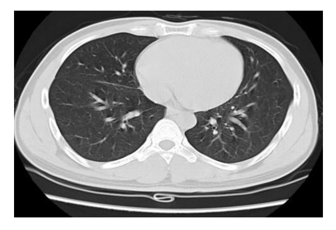
Figure 4: High resolution computed tomography thorax after six months of steroids therapy.